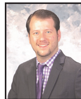
Director of Educational Services